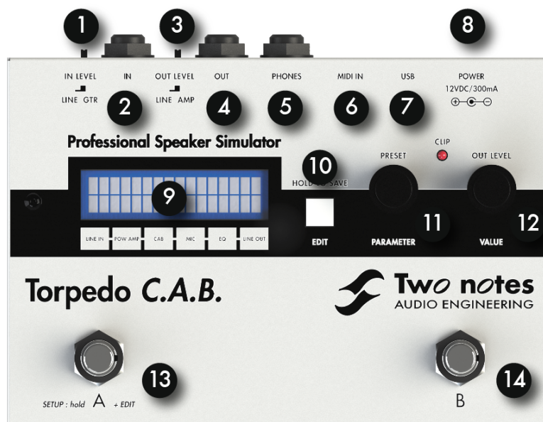
Figure 2.1: Front panel of the TORPEDO C.A.B.